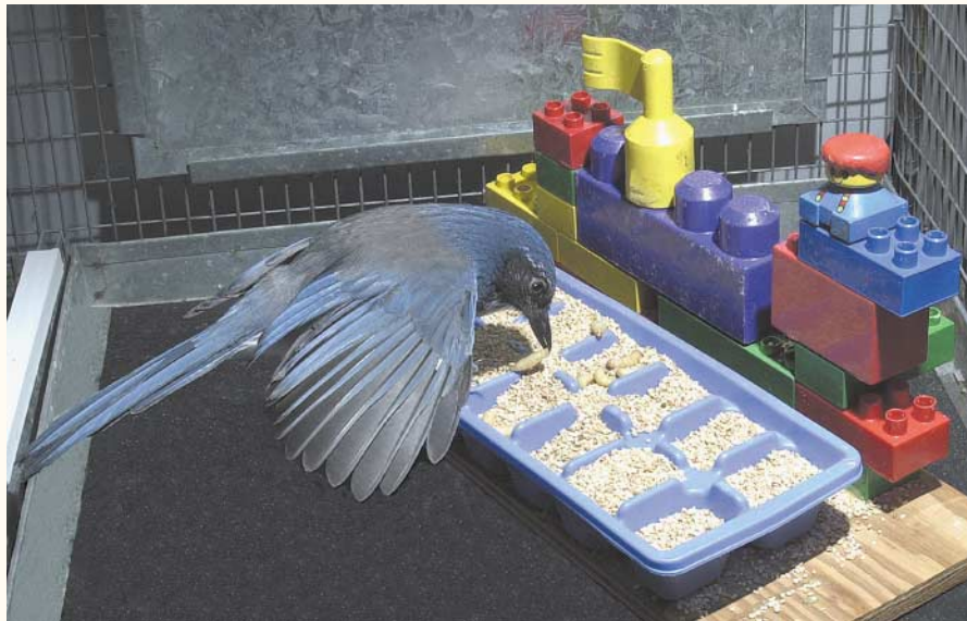
Figure 2 | A western scrub-jay caching wax worms. Birds hide the food items in trial-unique, visuo-spatially distinct caching trays filled with sand in which they can bury caches.

the information is encoded in a representational form that does not specify how this information is to be used in controlling behaviour. So an episodic memory should be able to interact with general knowledge (semantic-like memory) even if this information were gained after the episode had been encoded. Consider the case of the jay caching perishable food. If the jay establishes some wax-worm caches, and then subsequently discovers that worms generally degrade more quickly than originally thought, the bird should be able to update its knowledge about the rate of perishability and change its search behaviour accordingly, even though the episodic information about the worm caches was encoded before the acquisition of the new semantic-like knowledge about their decay rates. We found that the jays could do this — if they cached perishable and non-perishable items in different locations in one tray, and then subsequently discovered that worms from another tray had degraded more quickly than they expected, then when given the original tray back the birds switched their search preference in favour of the nuts. The birds continued to search for the perishable food if it had been cached recently. To our knowledge, this is the only demonstration of declarative flexibility in which animals can update their information after the time of encoding 52 .